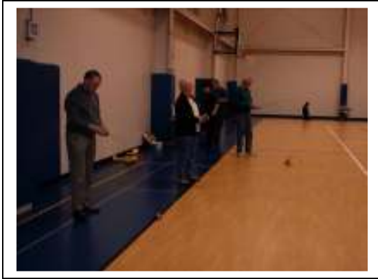
Members Flying In the Gym after the meeting.