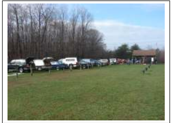
Above Photos taken on 1/1 FunFly great turnout