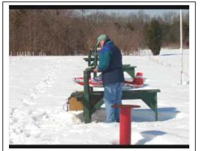
Above Photos of Ski Flying. Feb 2010