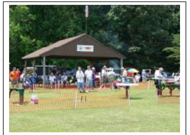
Above Photos taken at the Open house - June 2011