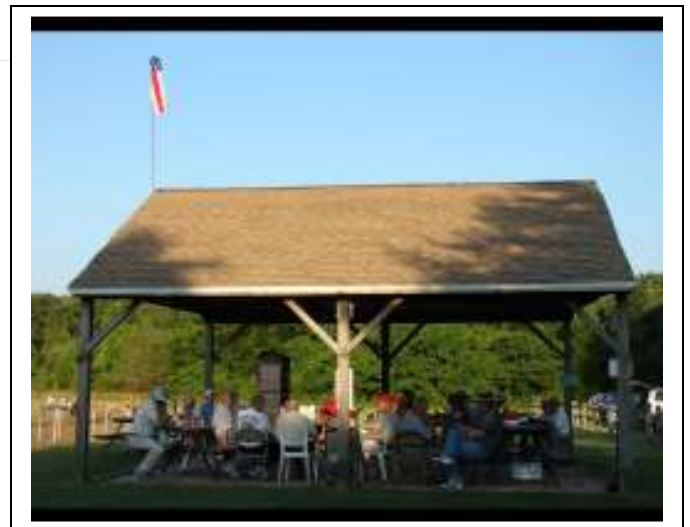
Above Photos taken at the Meeting June 18,2010