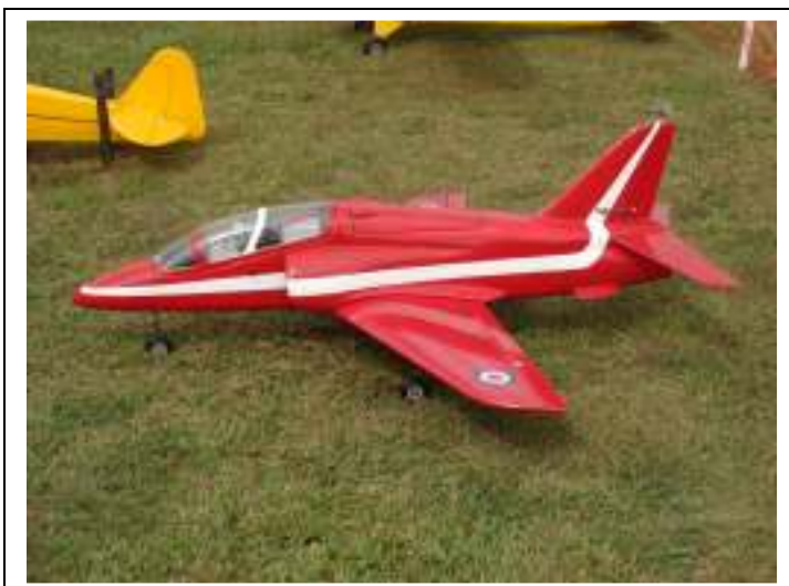
This is just a few Pics of Saturday's Event, There will be more on our Website as well as MDflying.Com

For now, May your Takeoffs and Landing be the same..